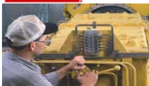
Auto Lubrication Systems