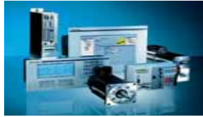
Servo Motors & Drives